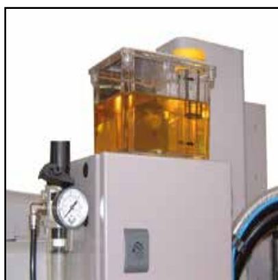
Minimal lubrication system (Optional) OPTIONAL

If required, the electronic inverter for variable blade speed allows the operator via keyboard to adjust the machine to be able to cut a wide range of materials and different sections. The change of speed is via inverter and it does not affect the power of the engine even at low speeds.