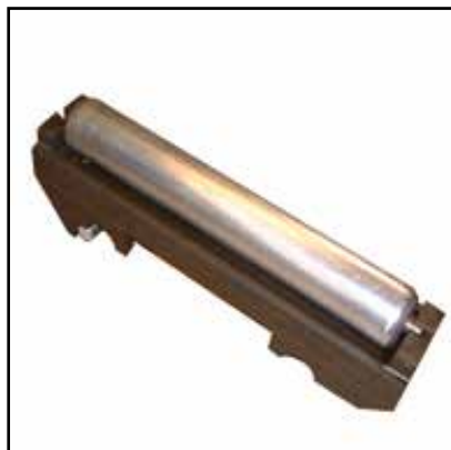
Feeder supplementary roller (Optional)