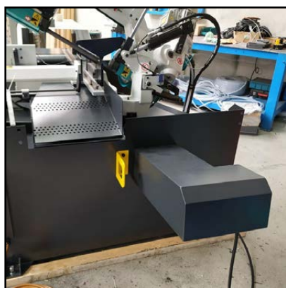
Motorized chip conveyor (Optional) OPTIONAL

It is possible to require, for all Imet machines, the minimal lubrication system, it avoids the dispersion of refrigerant liquid typical in the use of emulsifiable oil, the life of the blade is not in any way affected.