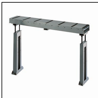
Loading/unloading table - following element (Optional)

Loading/unloading roller table, first element, 2 m long, maximum capacity 700kg