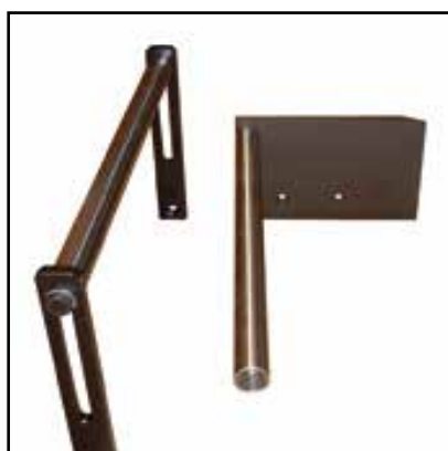
Horizontal rollers (Optional)