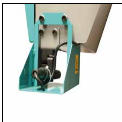
Laser ray (Optional)