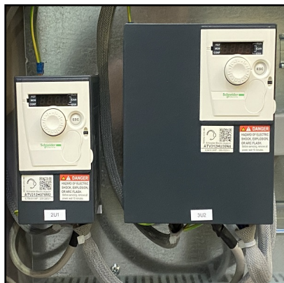
Electronic inverter for variable speed (18-110 m/min) (Optional) OPTIONAL

If required, the electronic inverter for variable blade speed allows the operator via keyboard to adjust the machine to be able to cut a wide range of materials and different sections. The change of speed is via inverter and it does not affect the power of the engine even at low speeds.