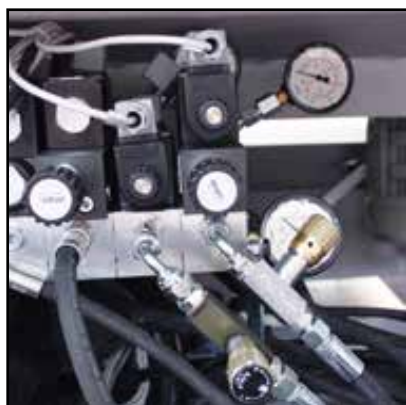
Two pressure reducers (Optional) OPTIONAL

It's available for all the CUBO SERIES automatic bandsaw an optional motorized chip conveyor placed laterally (on the loading side) of the machine. The chip conveyor allows to optimize the machine efficiency by removing remainings and chips while cutting.