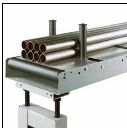
Pair of containment rollers (Optional)

Horizontal rollers for cutting more bars on the same row (Max. cutting capacity 250x100mm)