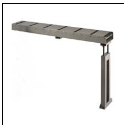
Roller table for loading / unloading side(Optional)

Loading/unloading roller table 1st element ,2m long, capacity 700 kg .